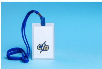
SCHOOL ID & LANYARD